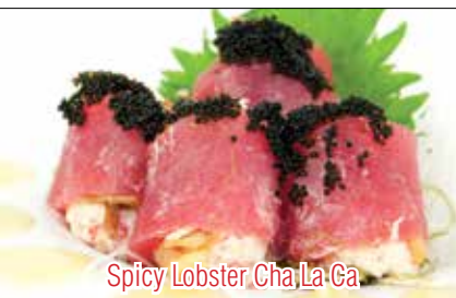
Spicy Lobster Cha La Ca