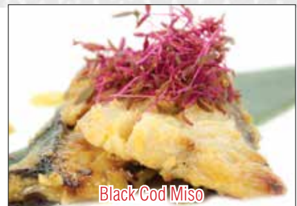
Black Cod Miso