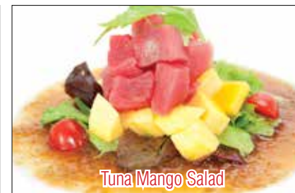
Tuna Mango Salad