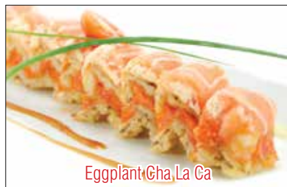
Eggplant Cha La Ca