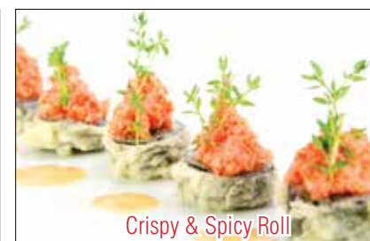
Crispy & Spicy Roll