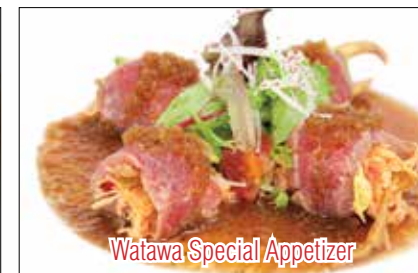
Watawa Special Appetizer