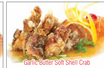
Garlic Butter Soft Shell Crab