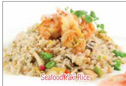
Seafood Yaki Rice