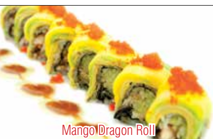
Mango Dragon Roll