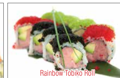
Rainbow Tobiko Roll