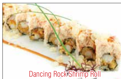
Dancing Rock Shrimp Roll