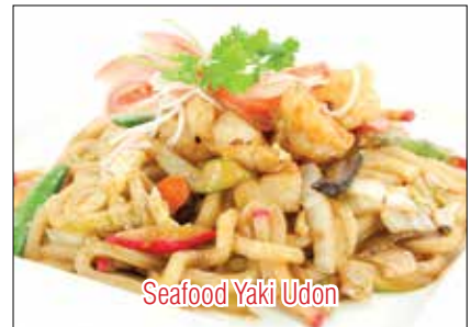
Seafood Yaki Udon